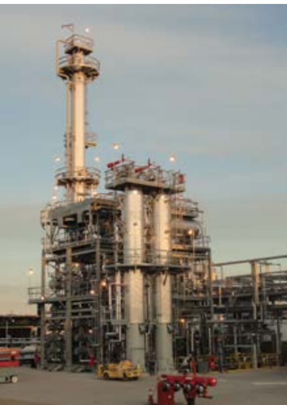
Badger BenzOUT technology at Husky Energy's refinery in Superior, Wisconsin.

Our benzene reduction technology can help you meet benzene regulations, increase octane and improve your refinery economics.