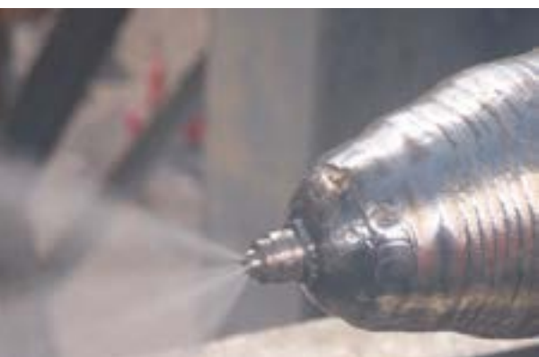
CST Spray Nozzle