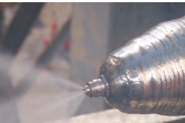
CST Spray Nozzle