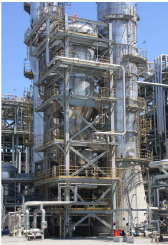
PetroChina Dushanzi Petrochemical Company's 320 KTA EB/SM Plant

Total's research facilities and five operating units are invaluable resources to the development and commercialization of styrene process improvements. Access to the operating plants also allows for demonstration of new or innovative concepts such as DHU.