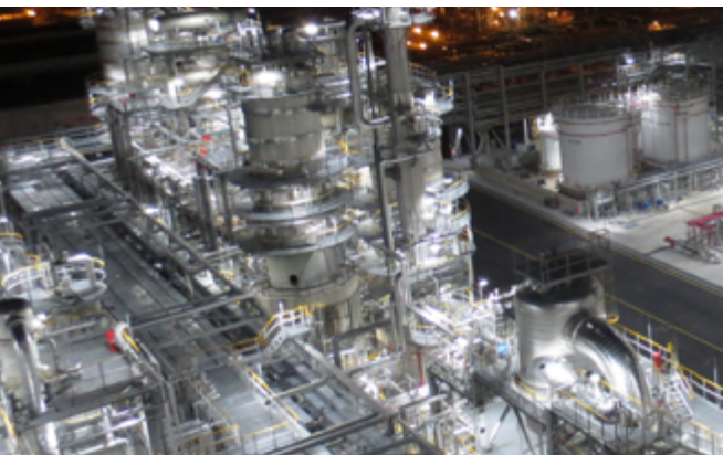
Cumene plant at night