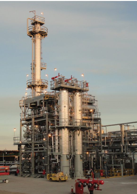
Badger BenzOUT technology at Husky Energy's refinery in Superior, Wisconsin.

Our benzene reduction technology can help you meet benzene regulations, increase octane and improve your refinery economics.